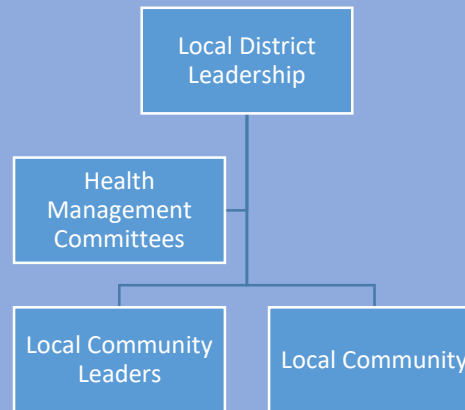
Fig. 2 Decentralization of public services was a key precursor to the success of a bottom-up approach

In Uganda, while reforms in the systems of governance in the form of decentralization have been crucial to the success of health service reform, health policy implementation has traditionally taken on a top-down approach. This paper presents an analysis of a bottom-up approach used to implement a user fee policy in Uganda.